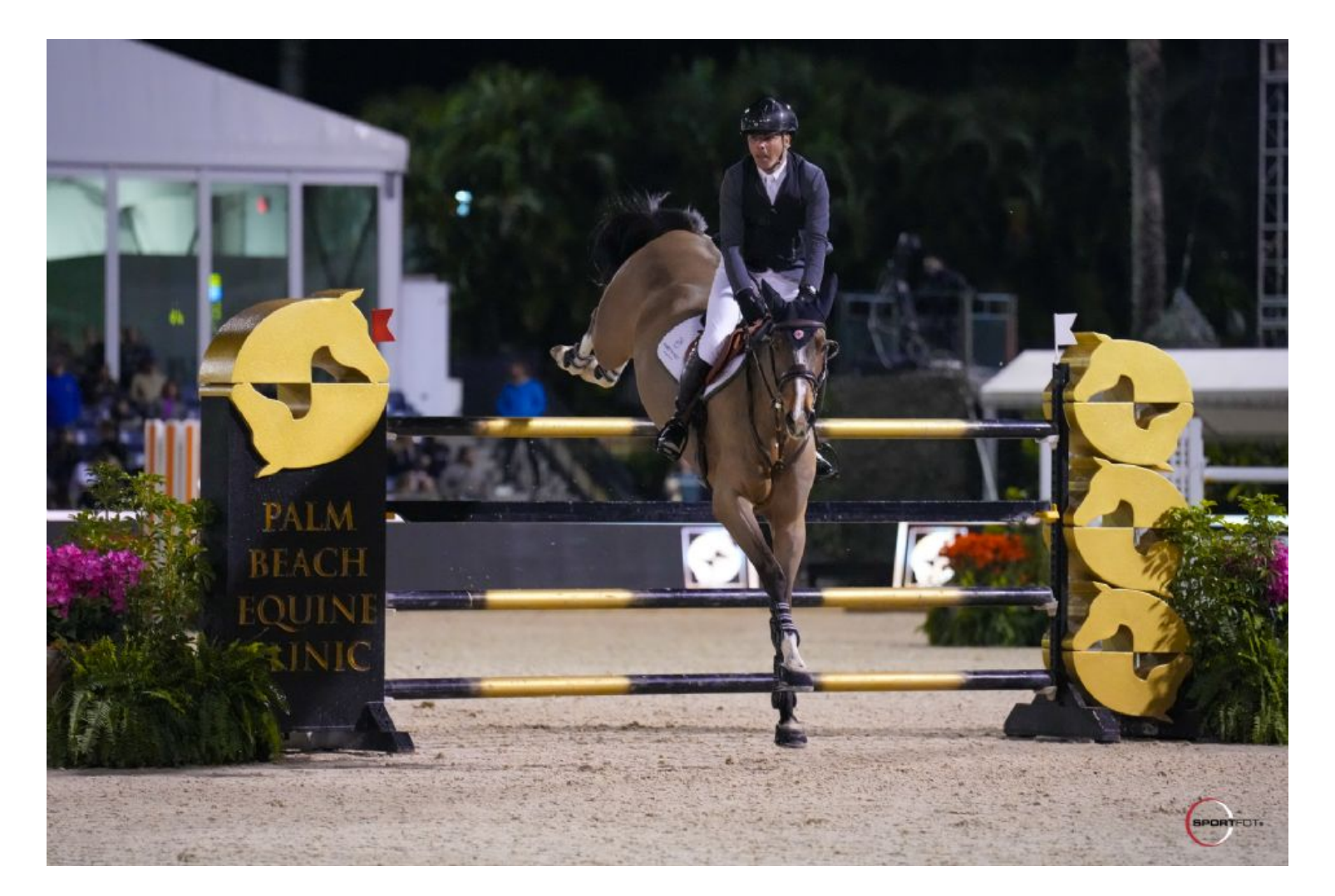
Rodrigo Pessoa and Gonzalo jumped to victory in the $50,000 Palm Beach Equine Clinic Grand Prix during WEF 2.

From an international field of 45 horse-and-rider pairs, 11 found the clear path through the course designed by Ana Catalina "Catsy" Cruz (MEX) to advance to the deciding jump-off. Spectators were on the edge of their seats as riders galloped across the International Arena for a shot at victory. With just two combinations to follow, the 2004 Olympic champion Pessoa put the pedal to the metal, crossing the timers in 38.421 seconds.