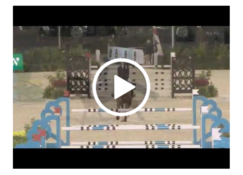
Watch the complete $50,000 PBEC Grand <u>Prix</u>.